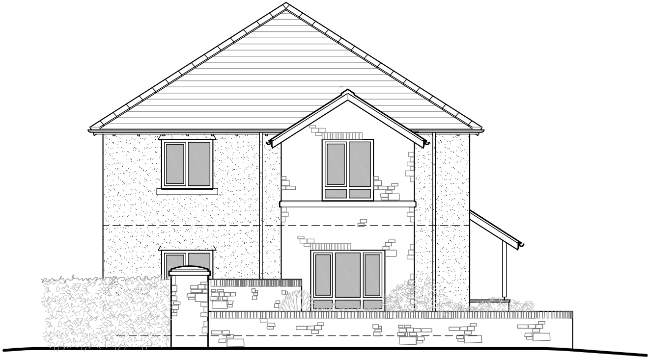
SIDE ELEVATION (NORTH WEST)