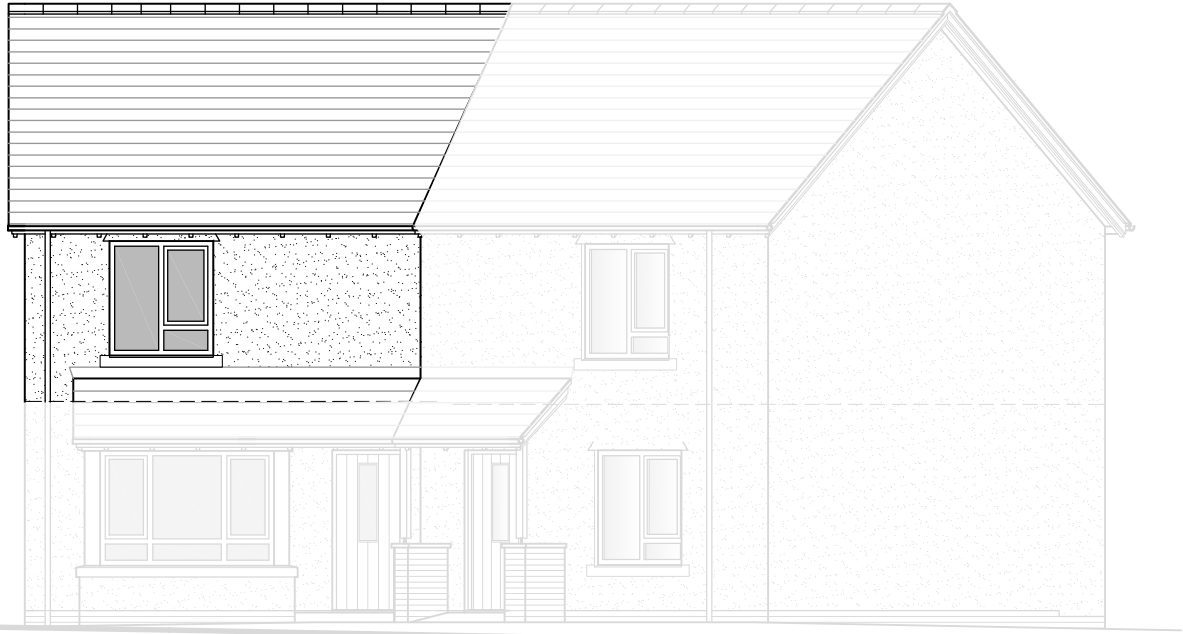
FRONT ELEVATION (SOUTH WEST)

Facing OverSands View (Access from rear)