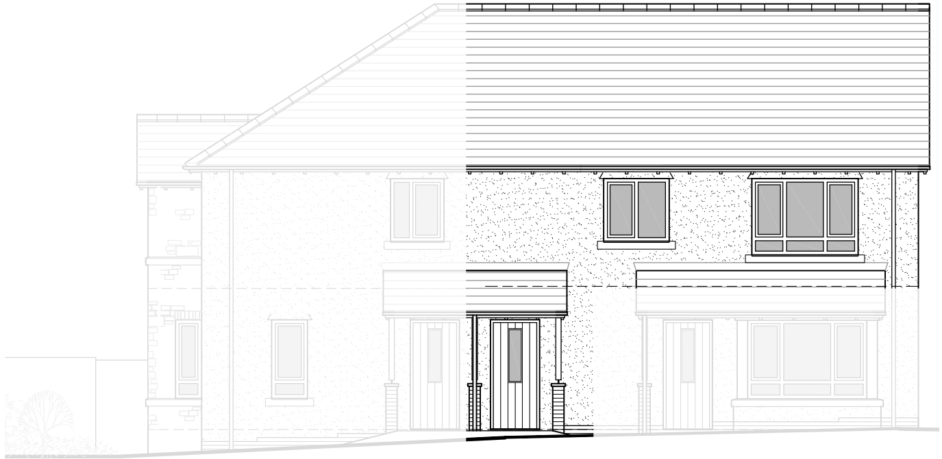
FRONT ELEVATION (SOUTH WEST)